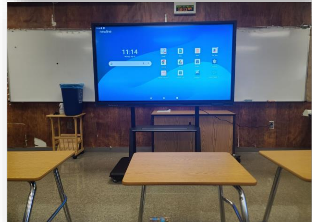
Richland HS Classroom